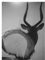
FIG. 3. AT THIS POINT IT IS UP TO YOUR CREATIVITY TO SCULPT THE BACKSIDE OF THE TROPHY, OR SIMPLY POSITION ON THE "SWING ARM WALL KIT"

FIG. 2. ATTACH MOUNTING PLATE TO BACKSIDE OF MANIKIN. MOUNT FLAT PLATE AGAINST BACK BOARD WITH TUBE OUTWARD, OR CUT A GROOVE SLIGHTLY WIDER THAN THE TUBE. RECESS THE TUBE SIDE INTO THE MANIKIN. USING 1 SCREW TO ATTACH TEMPORARILY, LEVEL THE ANIMAL. ONCE LEVEL, TIGHTLY ATTACH MOUNTING PLATE WITH THE REMAINING SCREWS (1 1/4" pan head screws provided). BE SURE TO EXTEND TUBE AT LEAST 1/4" BELOW BRISKET TO ALLOW FOR SKIN AND HAIR WHEN MOUNTED.